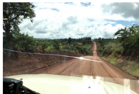
View of the road in Burundi from a mobile team vehicle.

Displaced villagers usually return to the village of origin within a week. Thus, the team ends support to this displaced group unless an individual follows up through the hotline.