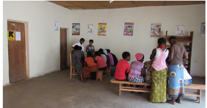
A community hall in Kamenge, Bujumbura served as the entry point for case management in this mobile site. Women and girls from the community organized non-GBV activities. The IRC mobile team visited the site twice a week to raise awareness of GBV and provide case management in the adjoining room. This was one of 4 sites on the weekly rotation of the Bujumbura mobile team.

In protracted sites of displacement in Northern Shan in Myanmar, in Makamba and Bujumbura provinces in Burundi and in Karbala in Iraq, the diagram on the following page represents the model that was used to establish mobile GBV services in each site. Entry points for case management were limited to temporary safe spaces identified in the mobile sites and hotline services. Mobile health services were explored as an entry point in Myanmar—however, the lack of private space (and inability to expand service space on the land where health clinics were established) did not allow for health services and GBV case management to happen simultaneously. Because this model did not allow for the appropriate confidentiality required for GBV services, the program shifted to providing case management either linked to group sessions in temporary safe spaces which were borrowed from the community or through GBV hotlines.